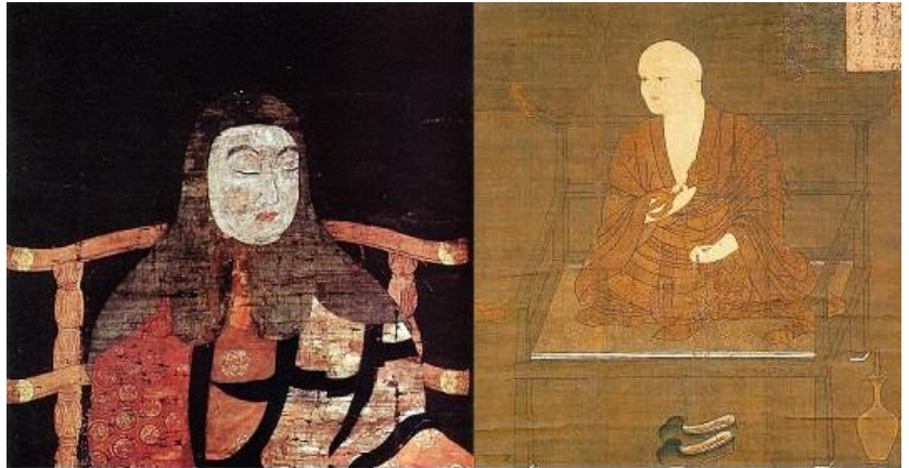
Saichō (left) and Kūkai (right) are two major figures in Japanese Buddhism.

became prominent centers of study. Both Saichō (767–822) and Kūkai (774–835) had studied in China and brought back sutras, teachings and ritual practices to Japan. Kūkai established a monastery on Mount Kōya and developed Shingon Buddhism. Shingon is one of the few surviving Vajrayana Buddhist lineages in East Asia, and today is a major denomination in Japan.