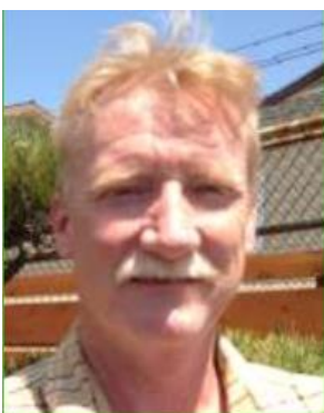
Rissho Kosei-kai of San Antonio